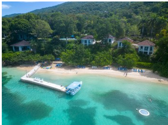
Aerial view — Suites & Treehouse

Full gallery: https://media.bluefieldsvillas.com/the-suites