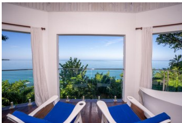
Veranda with sea view