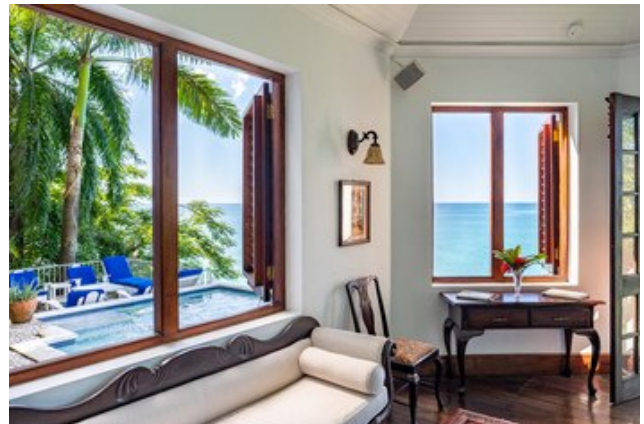
Downstairs master — pool view