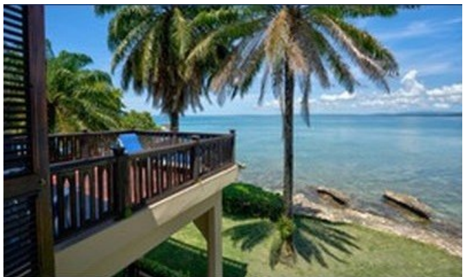
Caribbean sea view