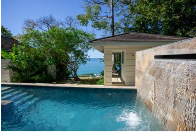
Pool waterfall & sea view

Full gallery: https://media.bluefieldsvillas.com/cottonwood-cottage