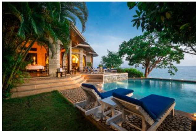
Pool at dusk

Full gallery: https://media.bluefieldsvillas.com/the-hermitage