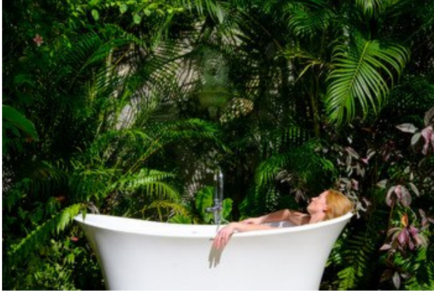
Master outdoor soaking tub

Full gallery: https://media.bluefieldsvillas.com/mullion-cove