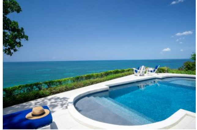
Pool with ocean panorama