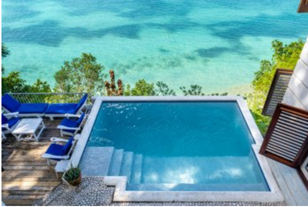
Pool with panoramic views

Full gallery: https://media.bluefieldsvillas.com/providence-house