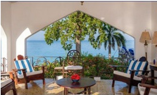
Sea view through arch