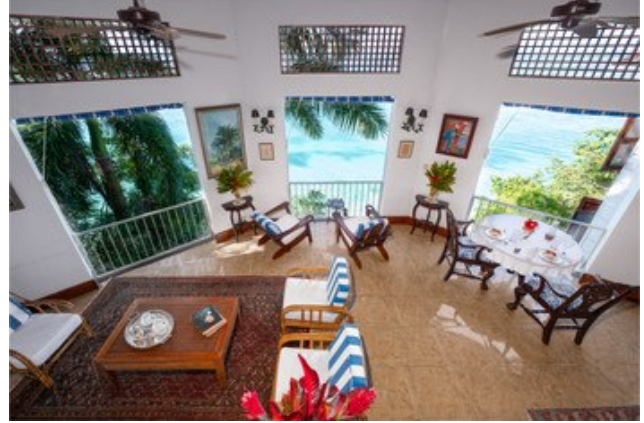
Full living room