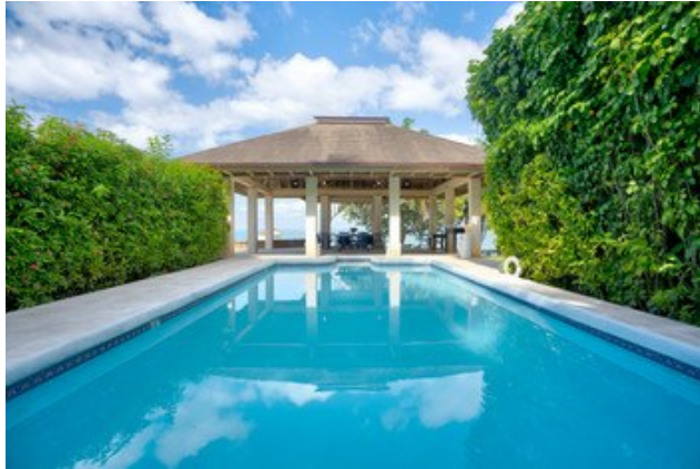
Pool & dining pavilion

Full gallery: https://media.bluefieldsvillas.com/san-michele