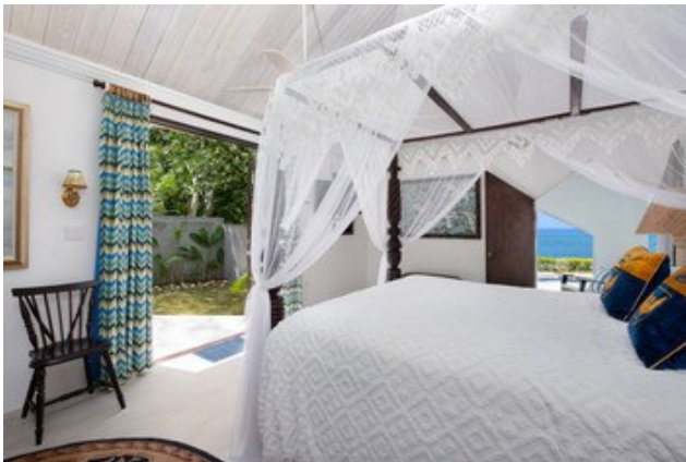
Master bedroom — sea view