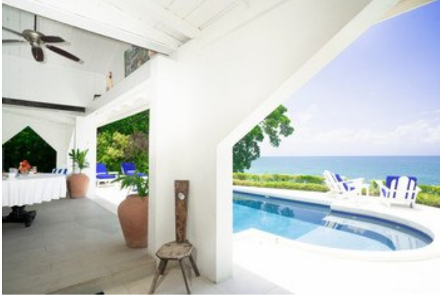
Pool & outdoor dining

Full gallery: https://media.bluefieldsvillas.com/milestone-cottage