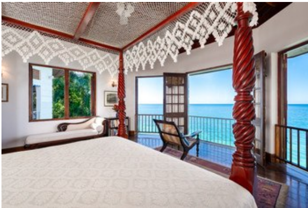
Upstairs master — sea view