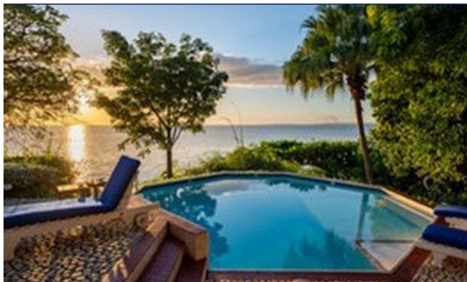
Pool at sunset