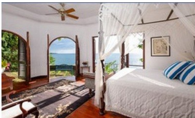
Master bedroom — sea view