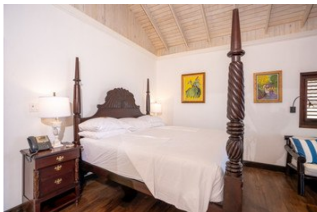
Four poster bedroom