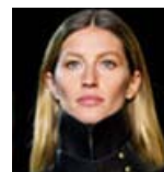
THE BEST LOOKS FROM NEW YORK FASHION WEEK