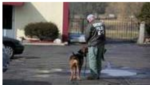
Video: Bloodhound brought in to search for missing woman