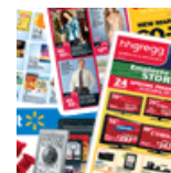
TOP DEALS FROM THE SUNDAY TRIBUNE ADS