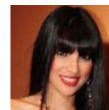
WHAT TO WEAR TO THE CLUBS THIS WEEKEND