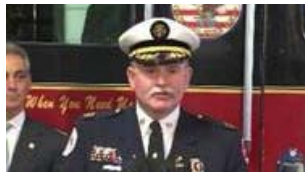
Fire commissioner Hoff steps down