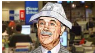
Col. Tribune's joke of the day: A dog at the movies